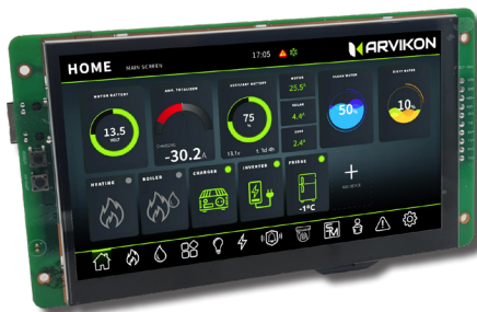
ArviView display OEM 7" & OEM 10"

ARVICORE is our next gen electroblock, at the core of the smart caravaning™ control system for recreational vehicles and marine.